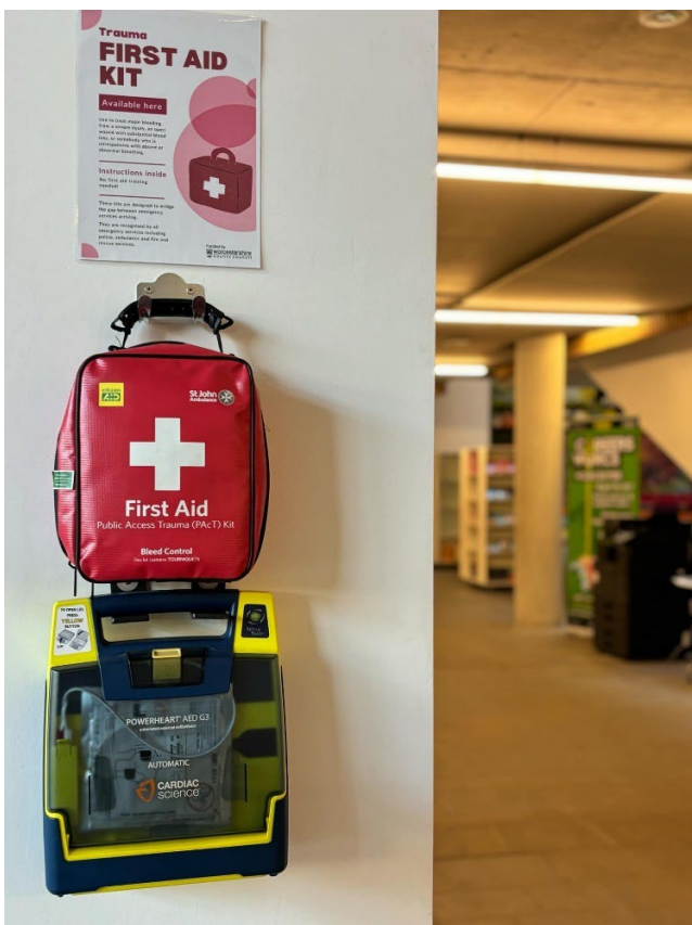
An image of a trauma kit placed near a defibrillator at County Hall. The kit is in a red case.